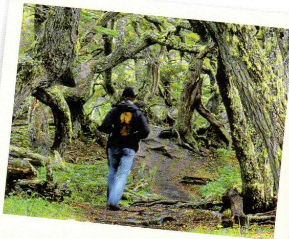
Trekking in the rainforest