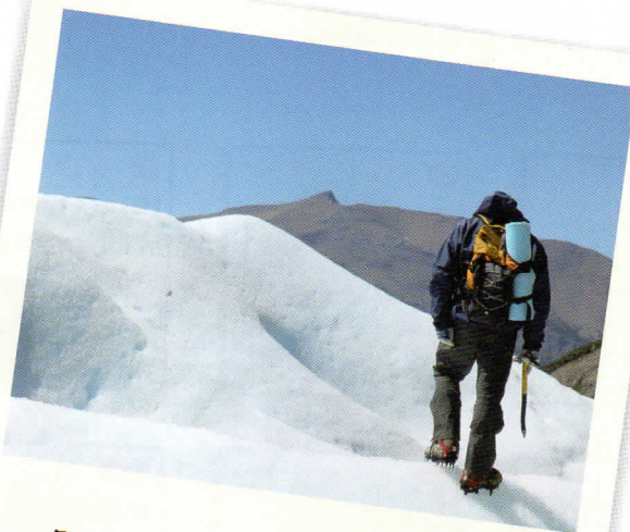
Expedition to the Antarctic